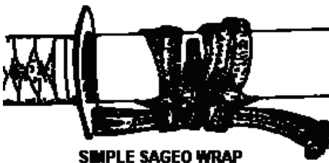
SIMPLE SAGEO WRAP

These wraps can be used for katana, wakizashi or tanto. The sageo on tachi is wrapped in a more complicated configuration.