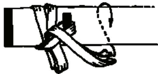
SIMPLE SAGEO WRAP STEPS (Sageo doubled)